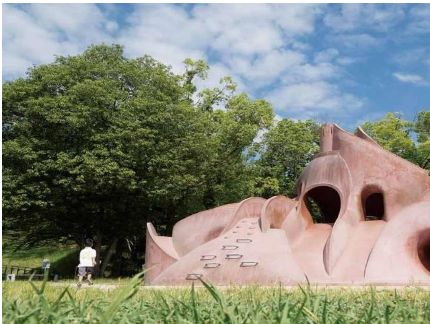
Photo: Ohbuchi-ike Park

[Inquiries in English] Phone: 0742-22-5595 (9:00-17:00) E-mail: nsgghyk@gmail.com